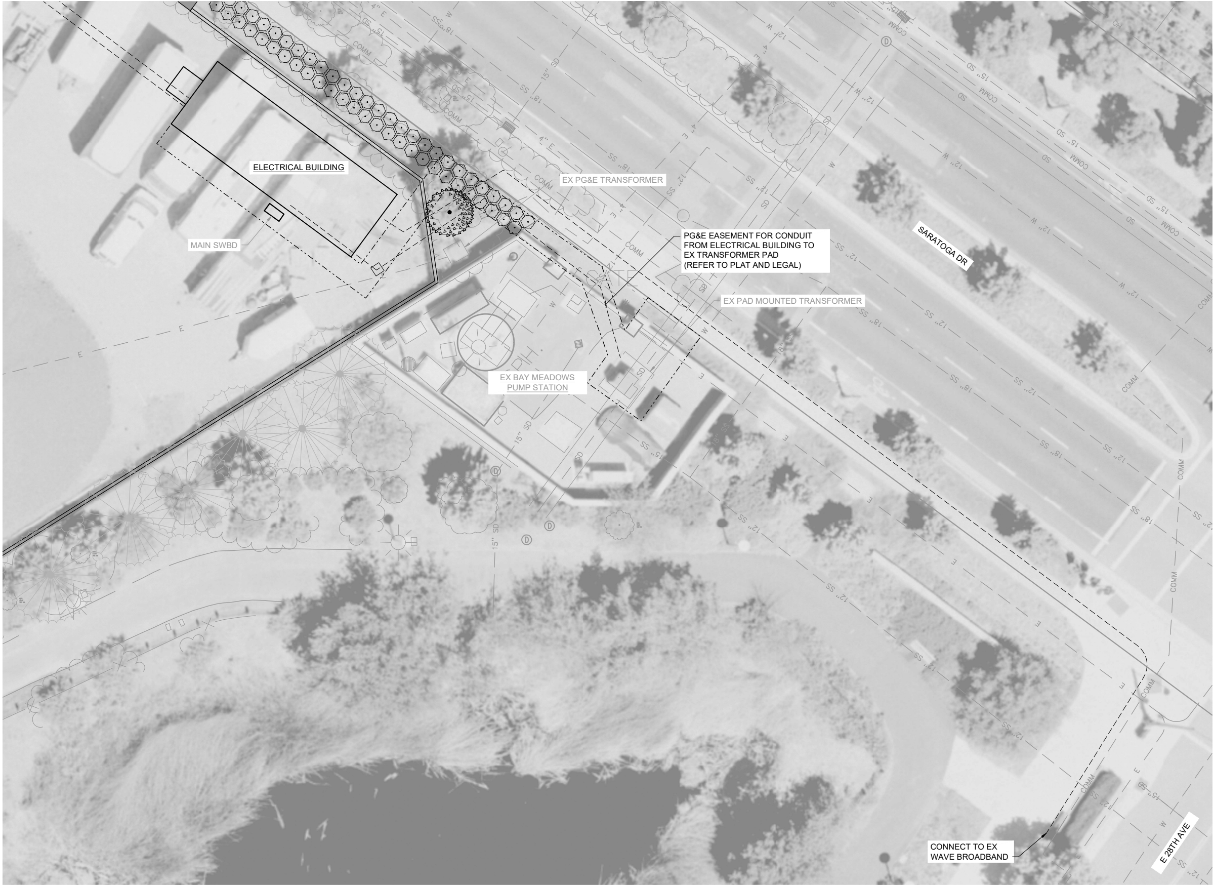
PLAN SCALE: 1"=10'